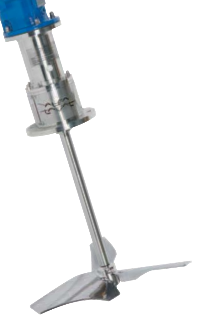
Alfa Laval's energy-saving agitators are modular, which makes them easy to customize for specific applications.