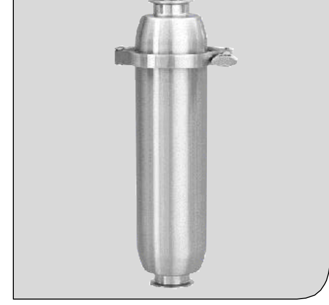
The Streamline<sup>™</sup> In-Line Filter/Strainer

Model SMS Strainers or FMS filters feature convenient sideentry and a pullout top (similar to Mainstream® design) for easy servicing without removal from the process line.