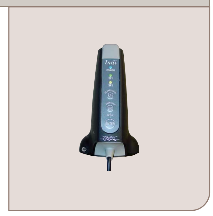
The indication unit IndiTop from Alfa Laval.