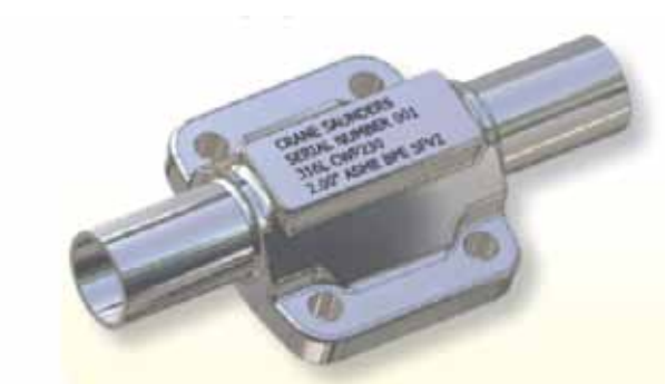
Please visit our Web-Based Drawing Library at: www.saundersdrawings.com for current database of drawings in PDF, 2D DWG, and 3D STP formats.

Saunders® Life Science Diaphragms meet all requirements of ASME BPE part SG (Seals). This includes General Provisions, SG-3.1, and conformance per SG-3.4.