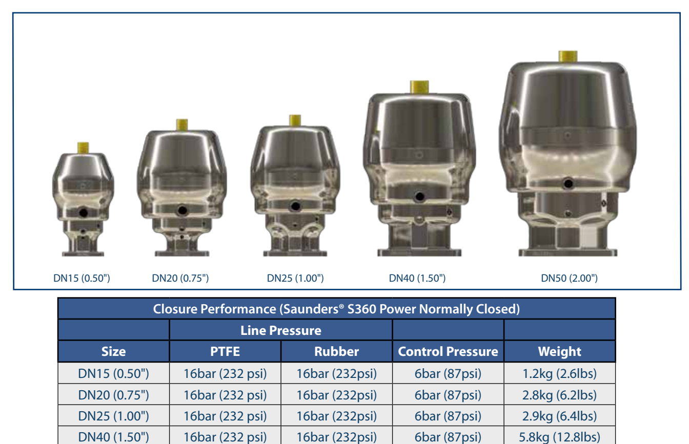
All pressures are gauge pressures. Line pressure values were determined with pressure on one side of the weir only. This condition is called 100% pressure drop, or 100% \Delta P . Information on line pressure applied to both upstream and downstream sides of the weir is available on request.

The Saunders<sup>®</sup> S360 Power range offers higher operating closure performance in a compact package for high operating pressure or atypical closing conditions with high pressure on both sides of the weir. The S360 Power normally closed actuator is available through sizes DN15 – DN50 (0.50" – 2.00").