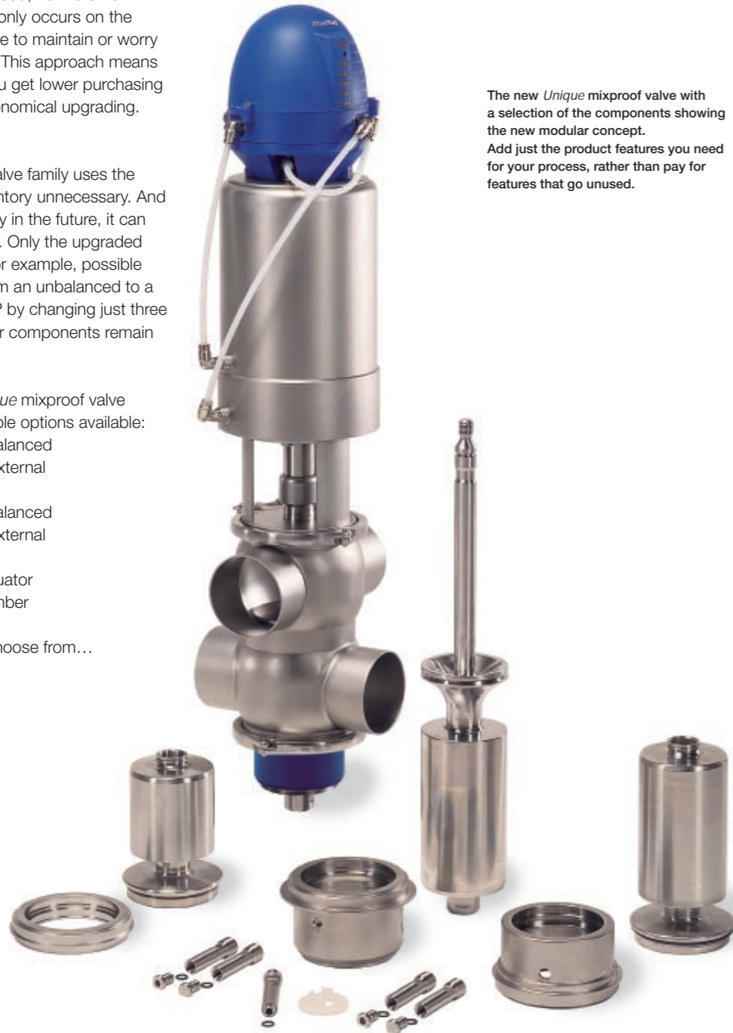
The new Unique mixproof valve with a selection of the components showing the new modular concept. Add just the product features you need for your process, rather than pay for features that go unused.