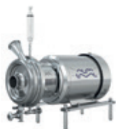
Alfa Laval LKH UltraPure